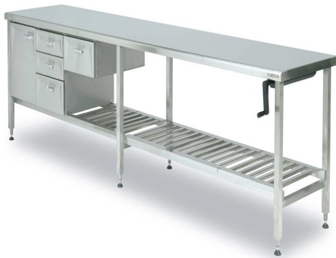
A table with hydraulic lift - type ATHM with manual lift - type ATHE with electric lift