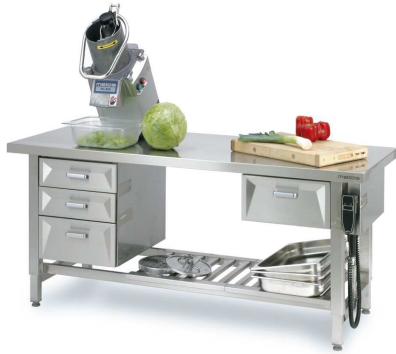
type ATE - only with electric lift