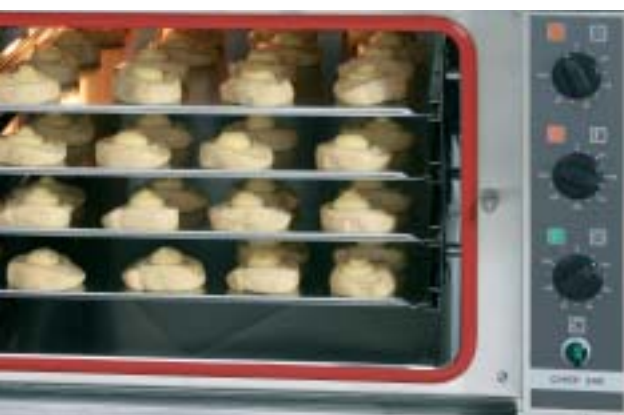
Chef proving cabinets

Hackman Chef is a first-class oven and proving cabinet series for demanding professional users. All Chef ovens produce impressive and uniform baking results. Chef ovens are easy to install, use, service and maintain. Design a productive combination for your own particular needs.