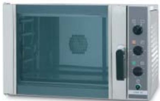
Chef 40 GN1/1

Hackman Chef 50 and Chef 40 ovens are built into the operational Bake-Off baking point for shops, cafés or industrial kitchens.