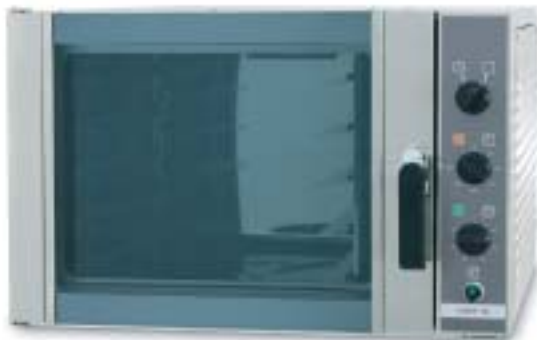
Chef 50 bakery plates 450x600 mm