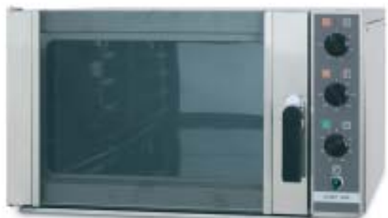
Chef 200 GN2/1

Hackman Chef 200 proving cabinet ensures uniform baking quality from start to finish. The proving cabinet can be assembled in a group with Chef ovens.