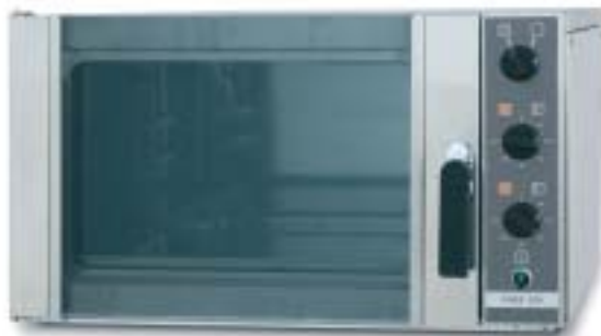
Chef 220 GN2/1

Hackman Chef 220 roasting oven is an effective standard oven for industrial kitchens and it is uniformly successful with all kinds of traditional cooking and baking. An optional heat storage stone evens out oven temperature and improves baking results.