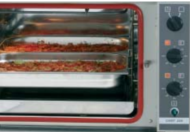
Chef roasting ovens