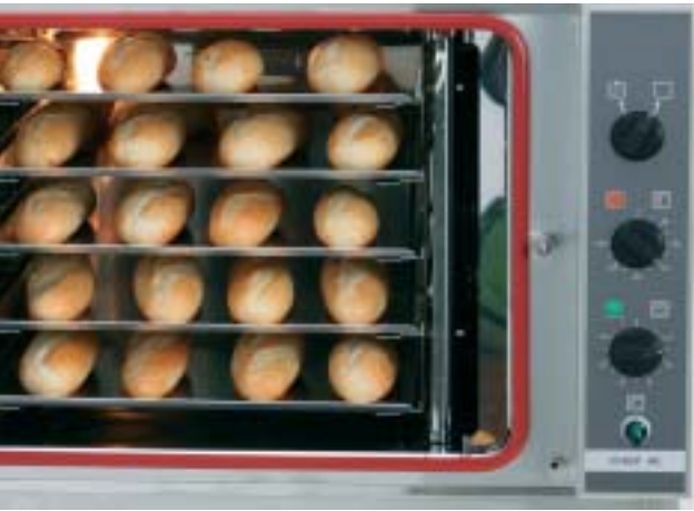
Chef convection ovens for cooking and baking