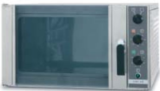
Chef 240 GN2/1

Hackman Chef 240 is suitable for all cooking and baking.