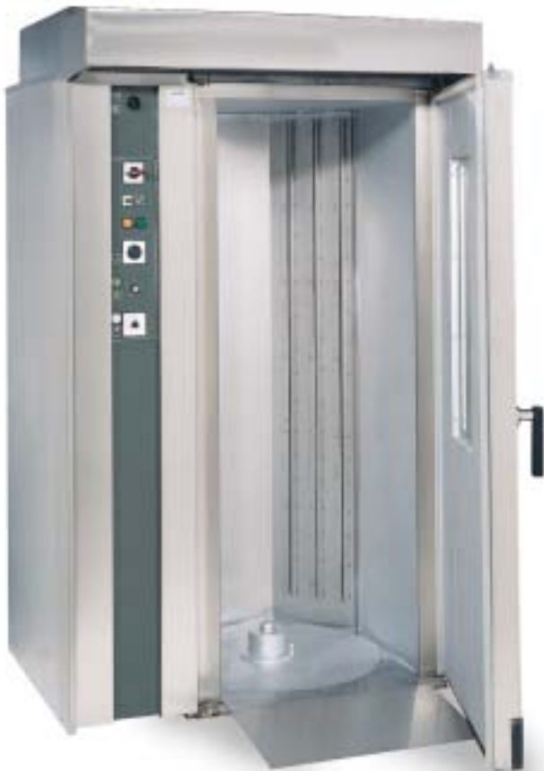
LU-KO 1PS bakery oven for fill-in trolleys. Hackman can also fit this oven with a large flashing alarm timer light, for those bakeries with high noise levels.

The LU-KO Rational 1PS oven, with its efficient and uniform air circulation and fill-in trolley that rotates during baking, guarantees uniform baking quality. The effective timer-controlled steaming system produces a fine glaze and crisp crust on bakery products. For these reasons, the LU-KO 1PS bakery oven is an excellent choice for patisseries, bakeries and catering kitchens.